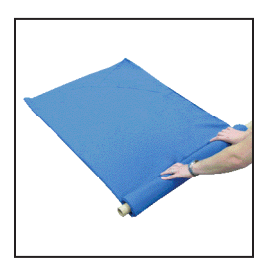
Step 1 Unroll table throw from packing tube, on table.