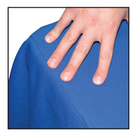
Place table throw over table. Position table throw with top seam at rear of table and graphic in the front.